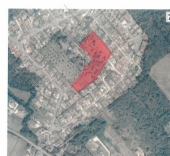
CIM Occitanie - Montauban