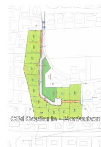
CIM Occitanie - Montauban

CIM Occitanie - 80 Allée des Demoiselles, 31400 Toulouse